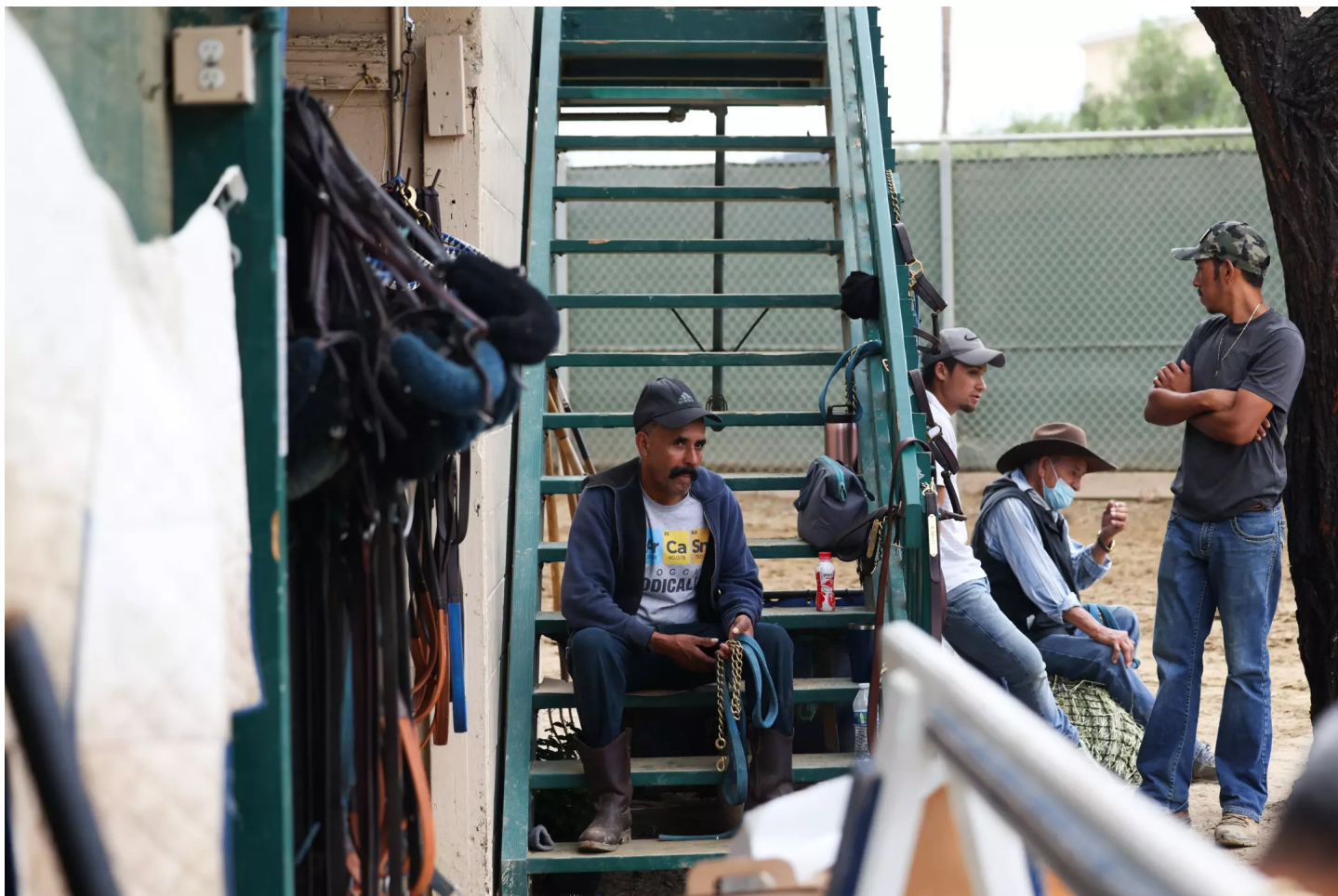
Backstretch workers take a break on Aug. 10.

“Hopefully, this is a program that can catch on across the country.”