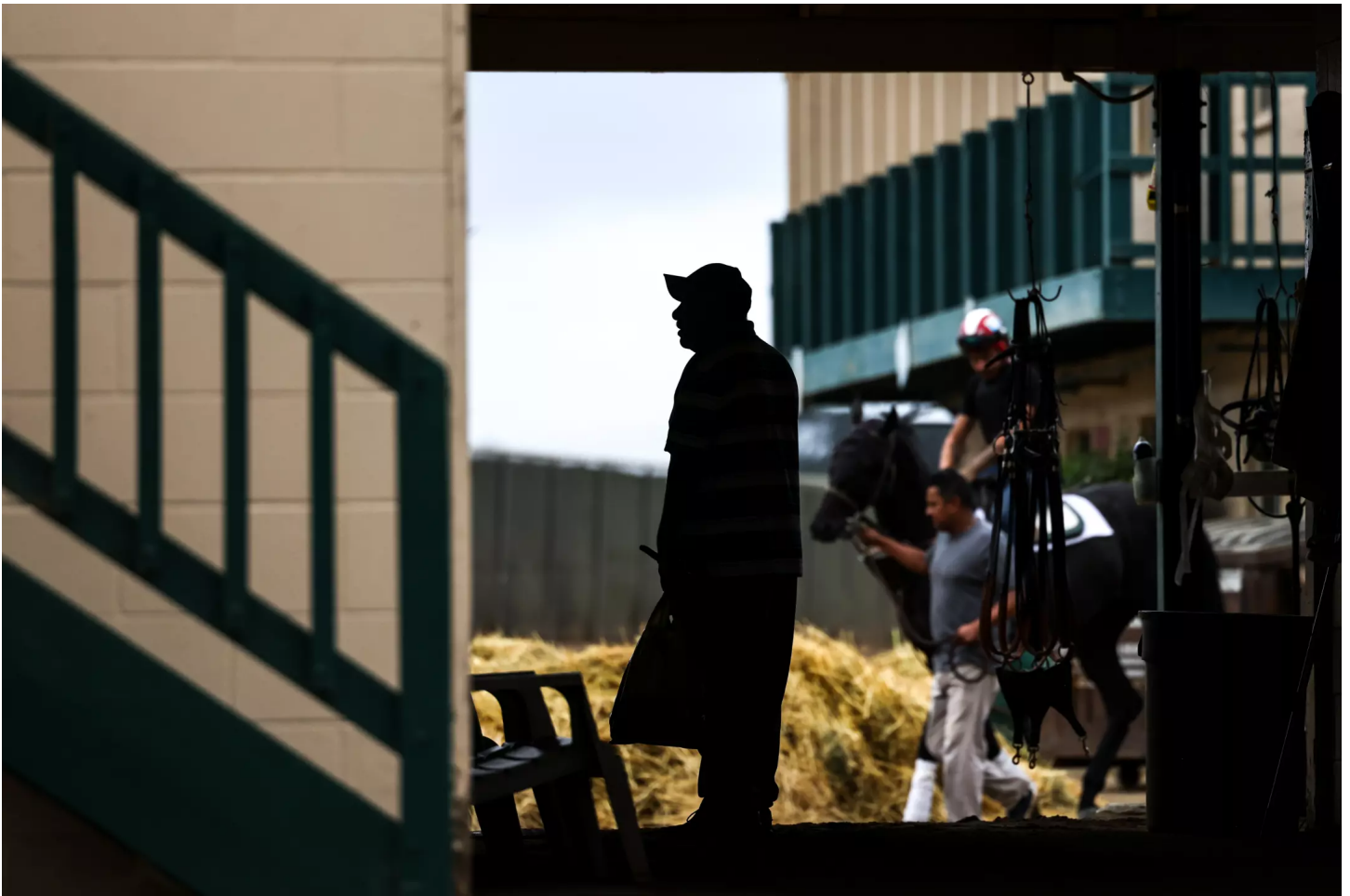
A person is seen silhouetted on the backstretch of the Del Mar Racetrack on Aug. 10.

That unshakable commitment is part of what makes Del Mar's decision to feed dinner to workers this summer so warming.