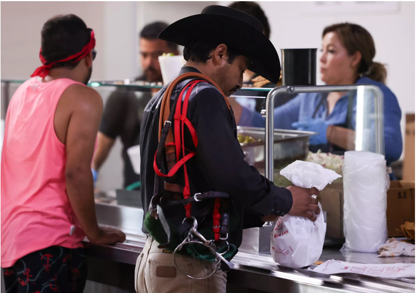
A backstretch worker collects his meal on Aug. 3.