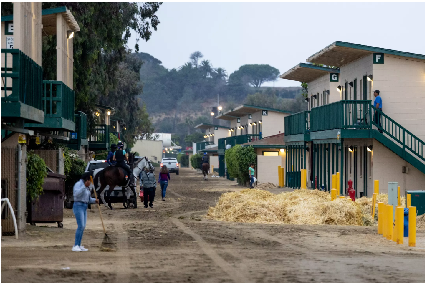
People work on the backstretch of the Del Mar Racetrack on Thursday.

Though the money is critical to those raising families through that sweat and sleeve-rolling, it's about more than simply staying afloat. It's about one of life's most valuable and profound currencies.