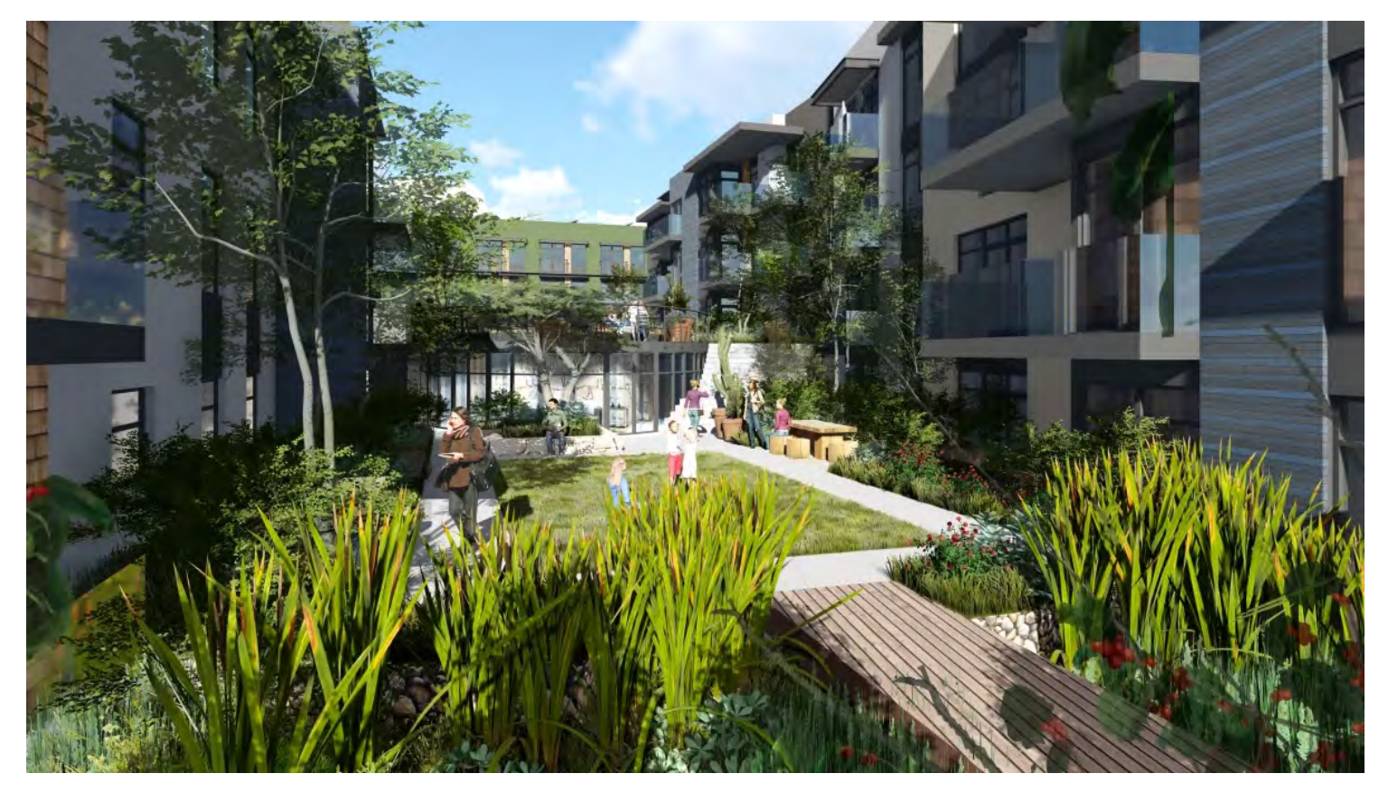
Rendering of the proposed Seaside Ridge project in Del Mar. (Wolden Design/McCullough)